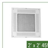
2' x 2' 45W (supernova)