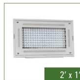
2' x 1' 22W